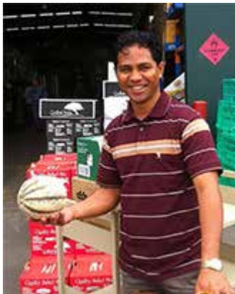
Br Agedo sorting out food parcels