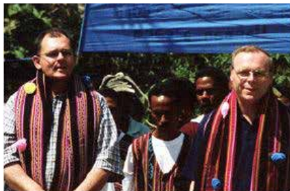
Celebrating 15 years of the mission