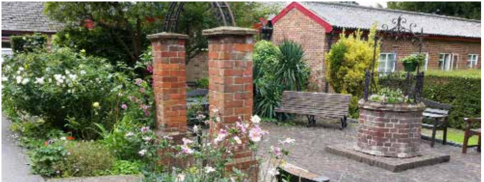
The gardens surrounding the Shrine are beautiful this time of year