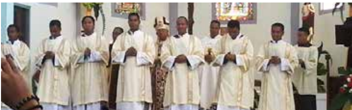
Seven new deacons for East Timor

As I mentioned above, the prayers you offer and the material help you give is certainly not confined to this part of the world. The British Province of Carmelites has always tried to support the establishment and growth of the Order’s mission areas and recently we have decided to give special attention to the island of East Timor, just north of Australia. The British Province has pledged £25,000 per year to support the training programme for young Carmelites in East Timor and in Australia itself. Just to give you an idea, the Australian province spends about £290,000 on formation each year, so the British contribution is quite significant.