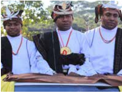
Three deacons were recently ordained to the priesthood