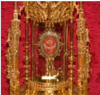
Relic of Saint Jude

“ ..a fresh look at his letter in the New Testament.. might prove fruitful for us today.. ”