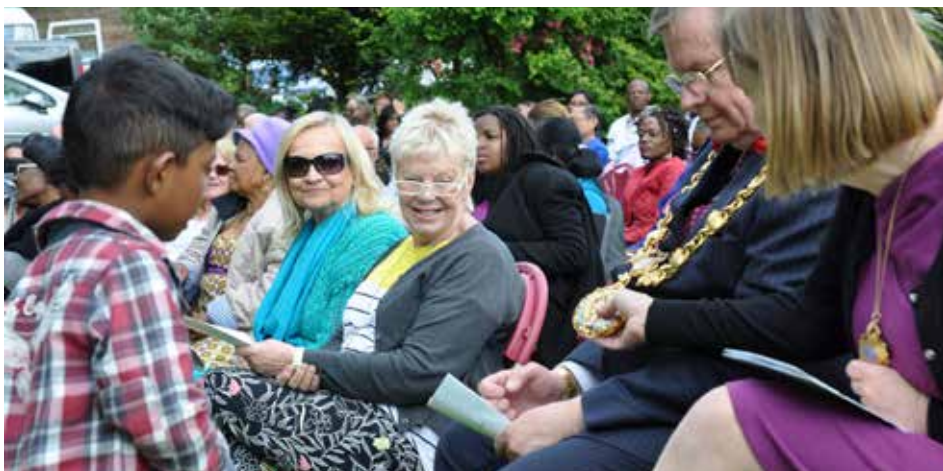
A young pilgrim checks out the Mayor's chain before Mass.