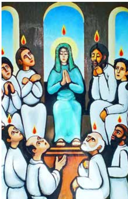
Icon of the descent of the Holy Spirit on Mary and the Apostles – Rosary Way, National Shrine of Saint Jude

So it is that on the day of Pentecost we are taught in the Scriptures that the Apostles were at prayer in the upper room with Mary the Mother of Jesus, when the Holy Spirit came down and appeared in the form of tongues of fire. I find it helpful to think that whilst for the Apostles (our friend Jude amongst them), this was their first experience of the Holy Spirit the same isn't true for Mary. In the Annunciation when she consents to be the Mother of God it is by the action of the Holy Spirit that she conceives Jesus in her womb. So on the day of Pentecost she knew who this was and what a gift was being given to the Apostles and, through them, to the Church.