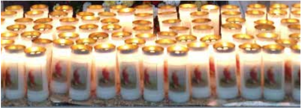
Prayers and candles at the Feast celebrations