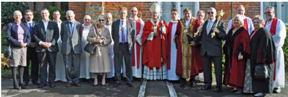
The Archbishop, the Carmelite Provincial and fellow friars, civic dignitaries, members of the Shrine management team, and other friends outside the National Shrine of Saint Jude.