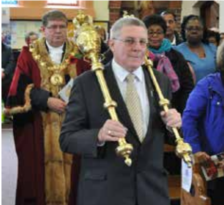
The Mayor of Faversham and his Town Sergeant process to the front