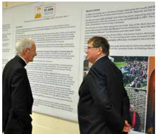
The Archbishop and Mayor look at the new display in the Shrine Information Centre