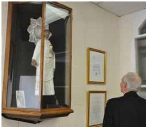
The Archbishop reading letters of congratulations to the Shrine on its Diamond Jubilee