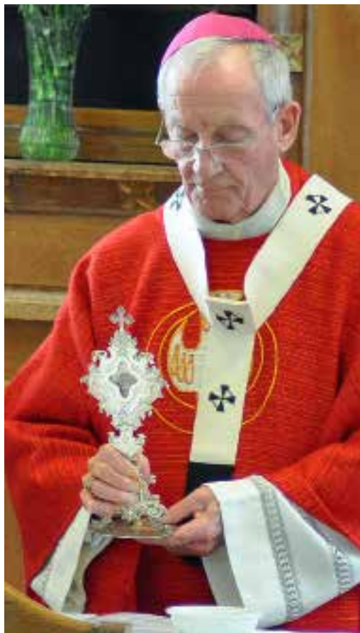
The Archbishop blesses the oil of Saint Jude