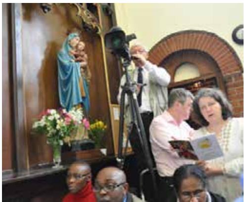
The Mass was filmed by a local friend of Saint Jude