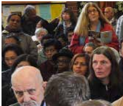
The church was full with the friends of Saint Jude